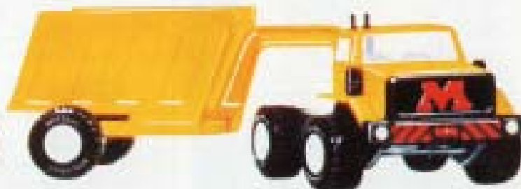
Articulated Tipper No. 3222