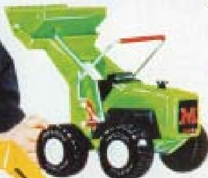
Tractor Digger No. 3243

The company with 70 years experience in British Steel Toys.