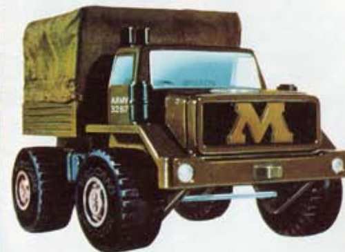
Model No. 3287 Army Truck with detachable fabric canopy. 262 mm long

'Naturals' for Christmas, and tough outdoor Moguls make even greater summer sellers!