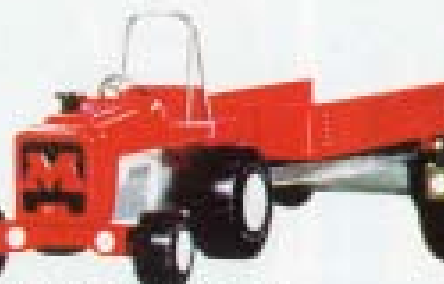
Tractor & Trailer No. 3265