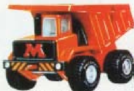
Dump Truck No. 3201