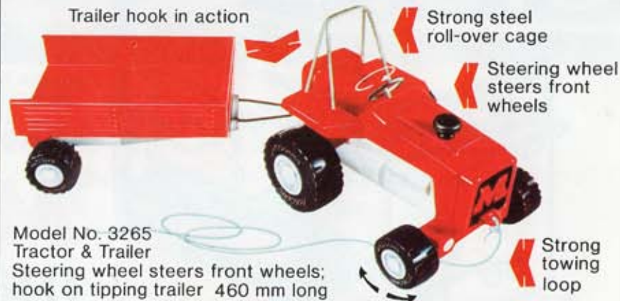
Model No. 3265 Tractor & Trailer Steering wheel steers front wheels; hook on tipping trailer 460 mm long