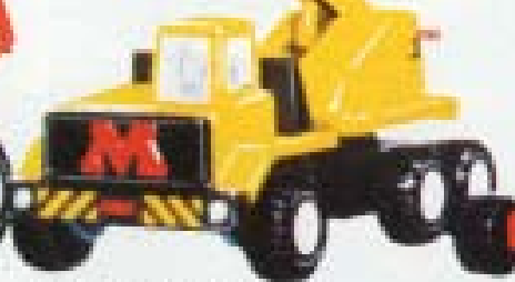
Mobile Crane No. 3299