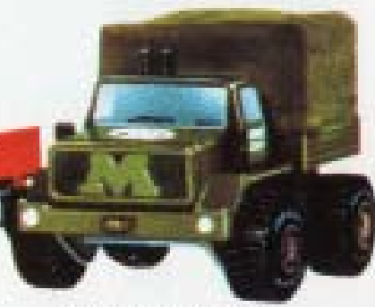
Army Truck No. 3287