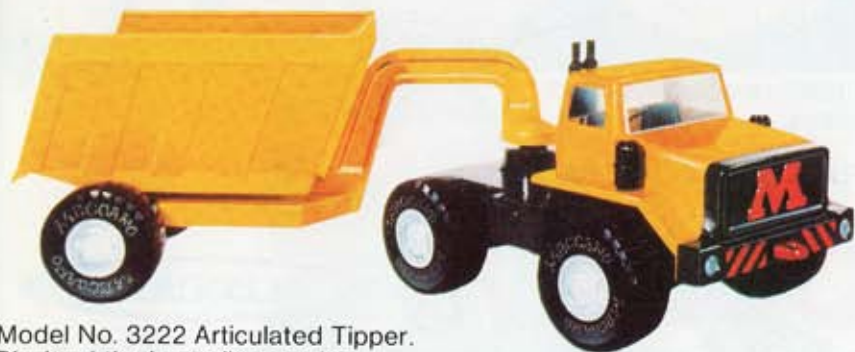
Model No. 3222 Articulated Tipper. Big-load tipping trailer can be detached from tractor unit