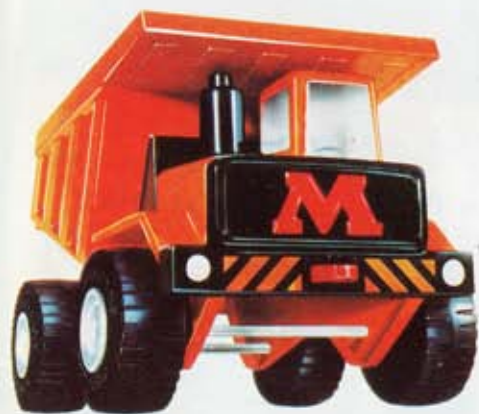
Model No. 3201 Dump Truck. Big-load carrier tips right up. 283 mm long